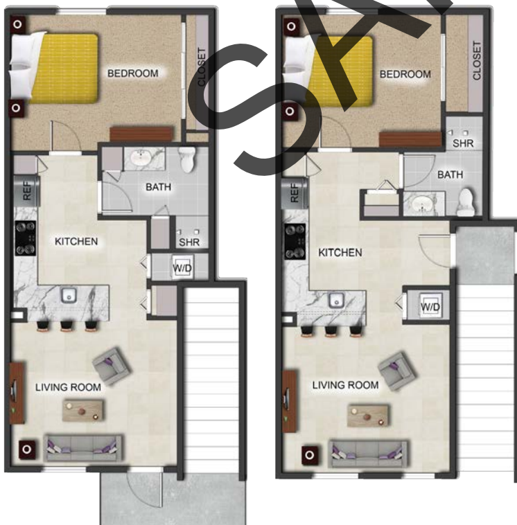
FIRST FLOOR OR SECOND FLOOR